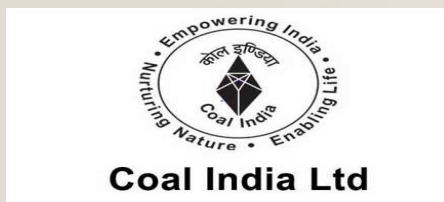
Coal India Ltd COAL INDIA LTD