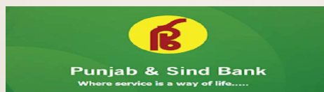
PUNJAB & SIND BANK