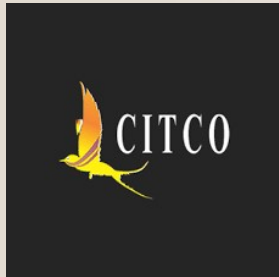
CHANDIGARH INDUSTRIAL & TOURISM DEVELOPMENT CORPORATION LTD