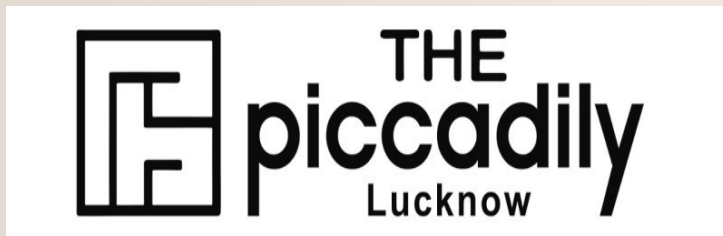
PICCADILY HOLIDAY RESORTS