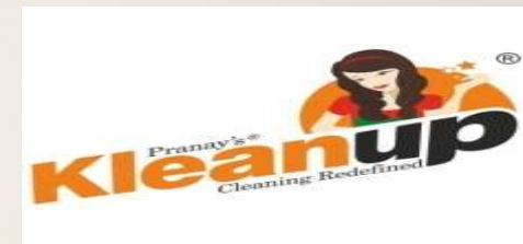
PRANAY CARE PVT LTD