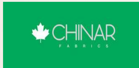
CHINAR FABRICS LTD